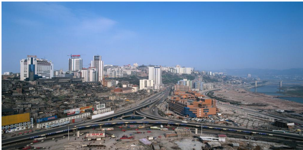
Picture 6 Original Caiyuanba Interchange

can keep vehicles driving along Nanqu Road. Vehicles driving on Changbin Road can drive along interchange ramp, then Caiyuanba Yangtze Bridge to reach South Bank Region rapidly. These newly built interchange ramps are designed reasonably to reserve original interchange and effectively develop the traffic functions of new and old interchanges, thus dividing vehicles here.