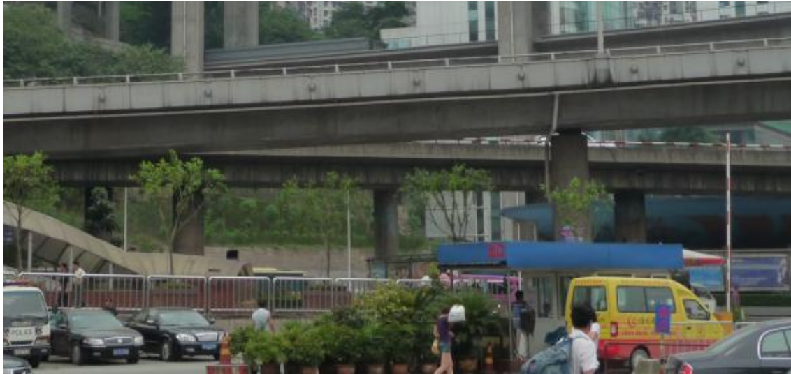
Picture 4 Pier of Original Caiyuanba Interchange

zones according to present situation, i.e., original interchange zone and newly built interchange zone. In original interchange zone, in order to coordinate the substructure with original interchange pier, cylinder pier (diameter 150 cm) is adopted at outside zone of bund. Meanwhile, pier is of vase type pier to ensure its consistency with main bridge approach in type.