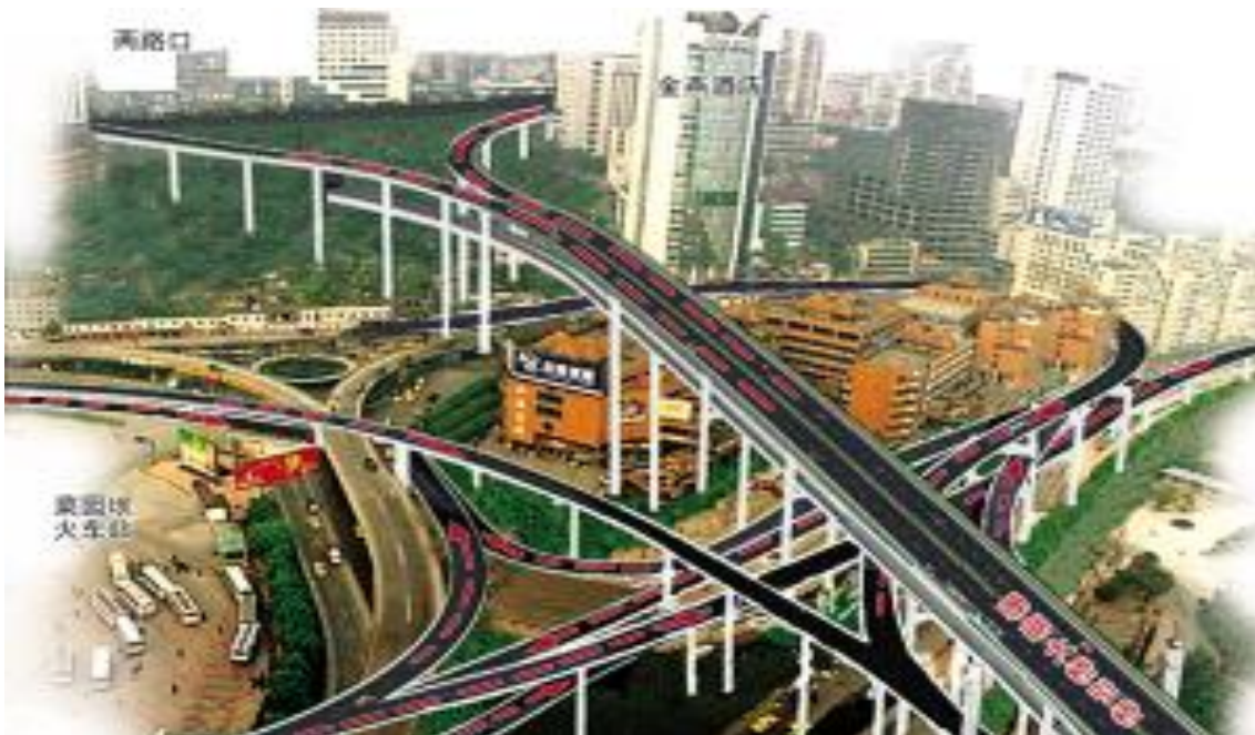
Picture 3 Multi-layer Semi-directional Partial Interchange

Vehicles driving from Tongyuanju to Lianglukou, Shangqingsi or other places can be divided through Caiyuanba Bridge, other than through Shibampo Yangtze Bridge, and drive off “Y” type ramp of Lianglukou Zhongshan No.3 Road, finally shortening vehicles’ traffic time.