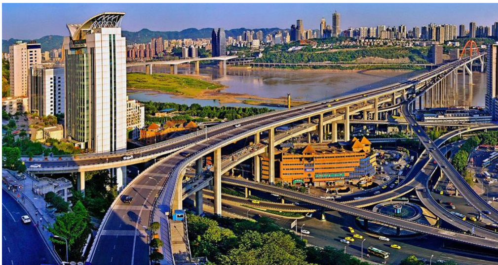
Picture 7 New Caiyuanba Interchange