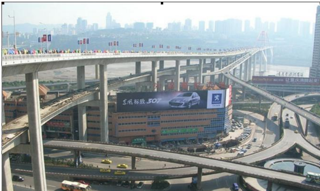
Picture 2 Caiyuanba Multi-layer Semi-directional Partial Interchange

To overcome various difficulties in design, 8 proposals were made during the preliminary design stage. Of the 8 proposals, 4 representative proposals were picked out for analysis, comparison and selection. Finally, a multi-layer semi-directional partial interchange proposal was determined.