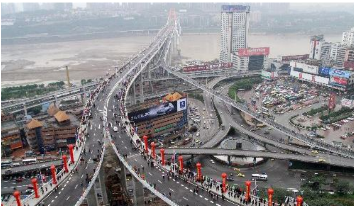
Picture 1 Caiyuanba Interchange